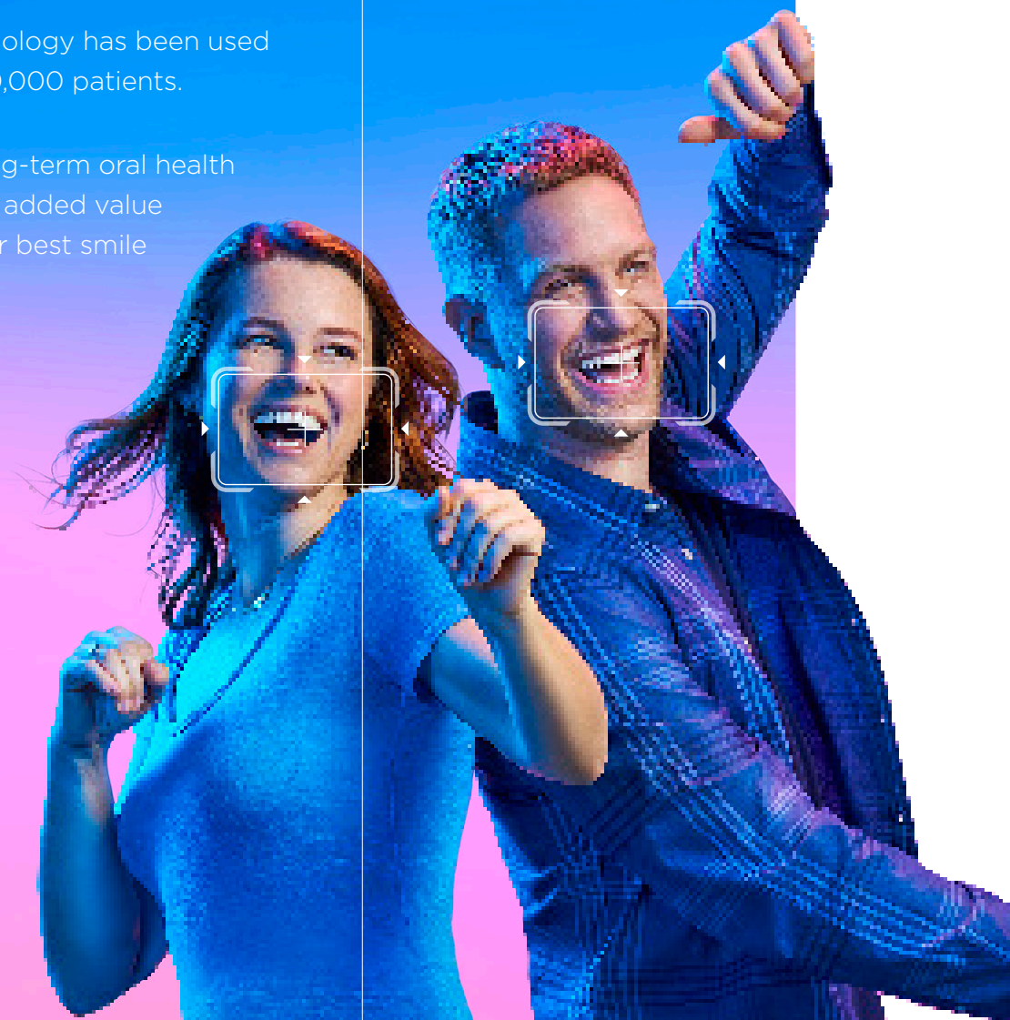
SureSmile treated cases- data on file 2021.

Invest in your long-term oral health and discover the added value that flashing your best smile can provide.