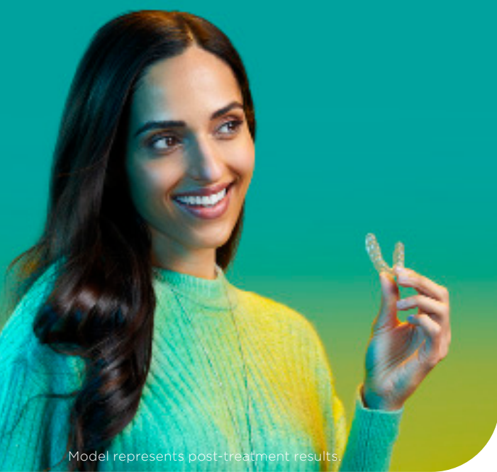
Model represents post-treatment results.